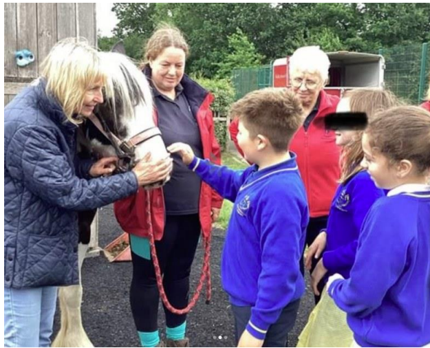
Working together in Lions