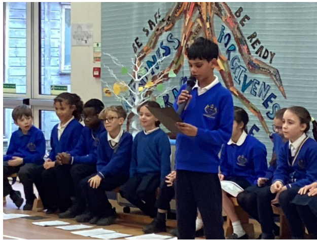
Amazing acting from our Drama Club!