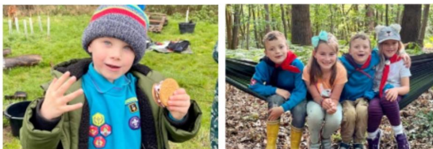
Beavers having fun last year.

This is a brilliant opportunity for you (and maybe your friends too, if they volunteer) to increase your skills, improve your CV and have fun. Did you know volunteering is GOOD for YOU!